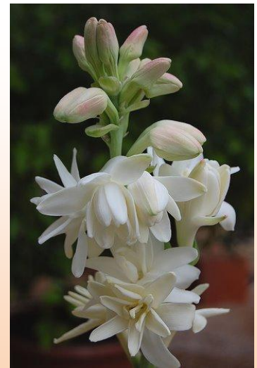
Perfect New Creation

Clustered, manifold and complete, it asserts its right to be