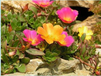
Sri Aurobindo's Compassion

Why is the flower symbolising your compassion so delicate and why does it wither away so soon?