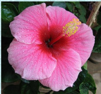
Beauty of the New Creation

The new creation strives to better manifest the Divine.